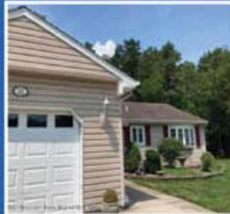
11 Point Blanche Ct