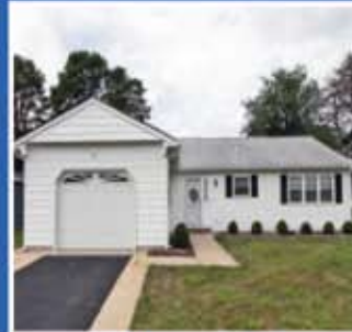
21 Panama Ct