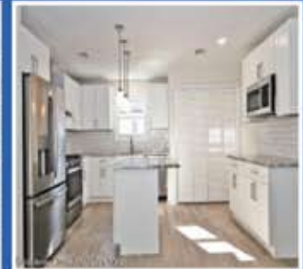
8 Camrose St.