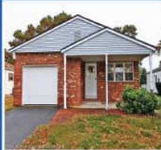
17 Manitoba Ct