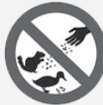
DO NOT FEED WILDLIFE