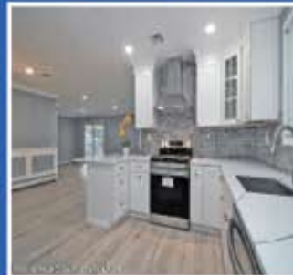
32 Orlando Blvd.