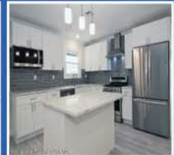
96 Orlando Blvd.