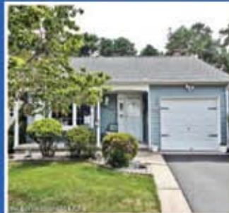
170 Pulaski Blvd.