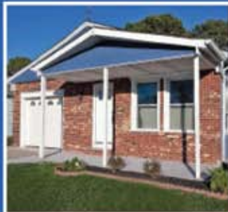
8 Chateux Ln